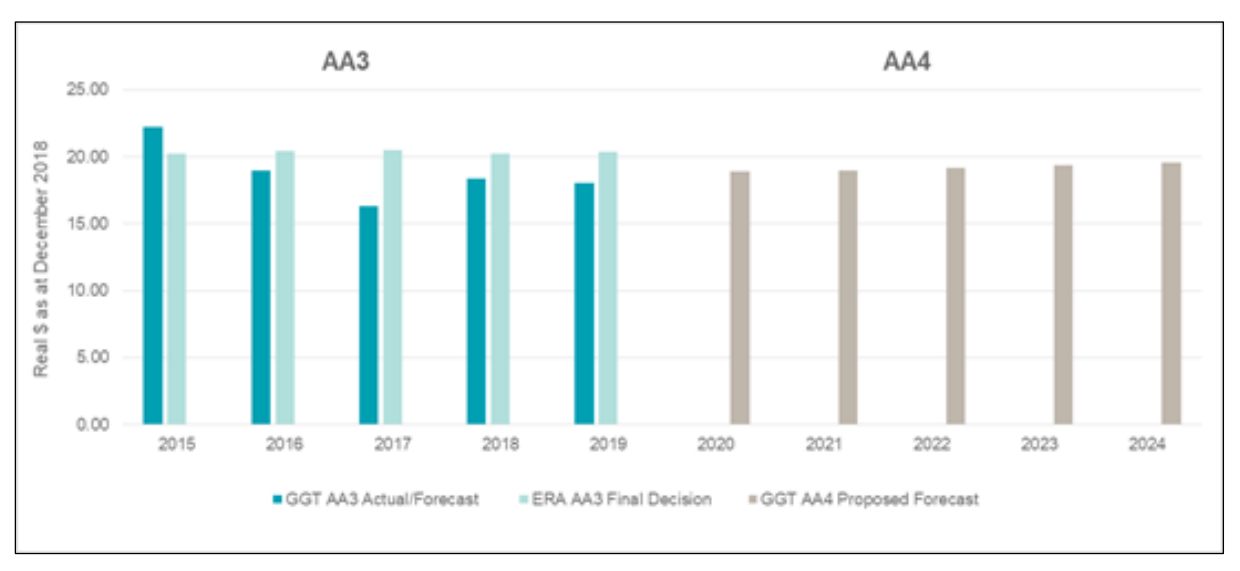
Figure 1 ERA approved forecast and GGT actual/forecast operating expenditure for AA3 and GGT's proposed operating expenditure for AA4 by year (Real $ 2018)