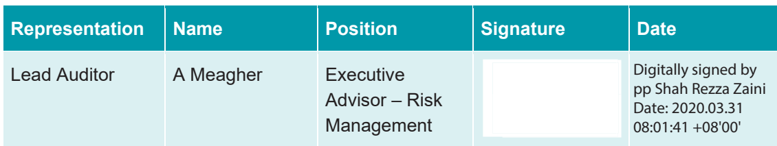
Table 1 - Lead Auditor's Approval

999 Hay Street Perth WA 6000 Australia | PO Box 3106 Perth Adelaide Terrace WA 6832