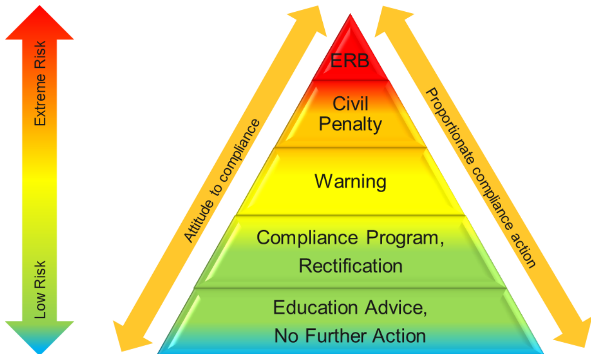
Figure 3: Compliance Actions