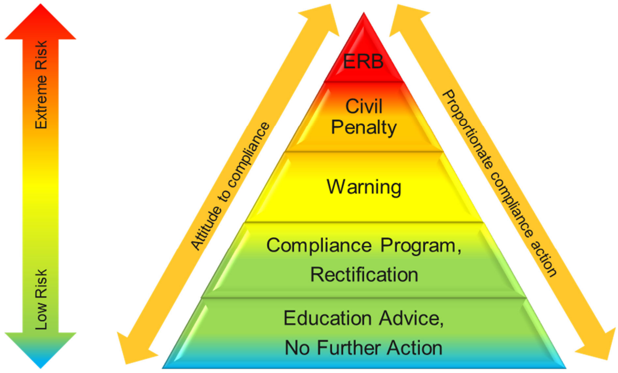
Figure 3: Compliance Actions

5.3.3 Figure 3 shows the compliance actions available to the ERA and how the ERA may apply them based on assessed risk. This information should be read in conjunction with step 5.2.8(c)(iii) above. Each matter investigated must be considered on a case-by-case basis having regard to the individual circumstances applicable to that matter.